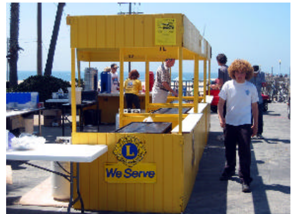
a winning combination -- Lions and Leos working together